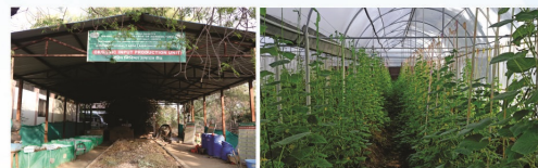
Organic Input Production Center