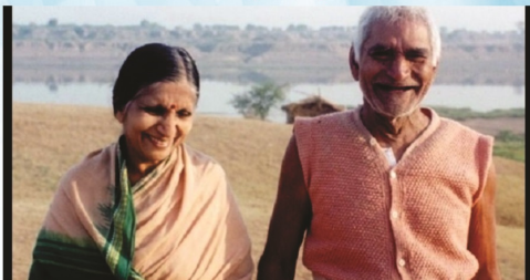
Shradhey Baba Amte & Sadhanatai Amte