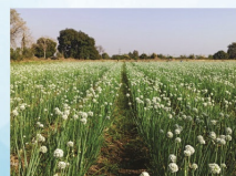
Onion Seed Production Programme

The college makes all efforts to carry on need based research for the benefit of farmers and students. Multi location trials of various varieties of different companies to ascertain geographical feasibility of various crops like cotton, paddy, chickpea, banana, soybean, turmeric etc are conducted on college farm