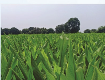
Demonstration Plot for Waigaon Turmeric (High in Curcumin)

With all facilities and support of college students from such a small township like warora are constantly scaling global heights in academic professional and research fields.