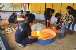
Poultry Production Unit